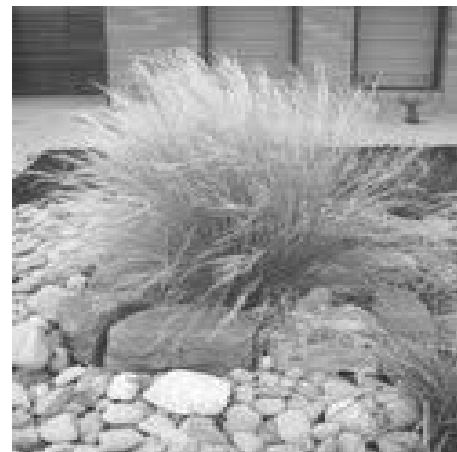
Mexican feather grass

Many invasive terrestrial plants are sold online, such as Mexican feather grass ( Nassella tenuissima ) and ivy gourd ( Coccinia grandis ). A number of bulb species listed on the websites of eastern states businesses can also become serious weeds if they escape from the garden. However, the