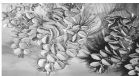
Salvinia choking ponds and waterways

When aquariums are emptied their contents often include aquatic plants, and for some reason people who clean out their garden pond also seem to think they are doing nature a favour by putting their excess water plants in the