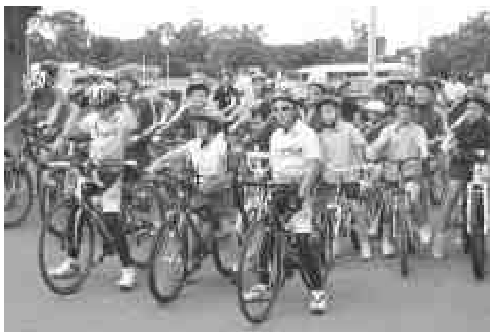
The Boys as part of the Trek