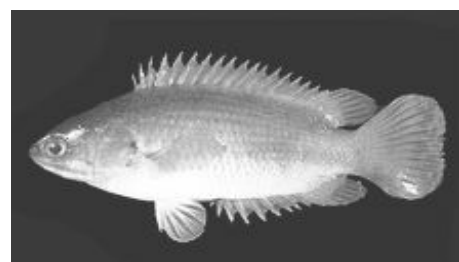
Climbing perch ( Anabas testudineus ) – a noxious fish not wanted in our waterways

potential for invasiveness is not the only reason for certain bulbs to be a problem. Some are hosts of diseases that could affect important crops grown in WA. Star of Bethlehem ( Ornithogalum umbellatum ) bulbs have been prohibited entry into WA for some time because this species is the alternative host for barley rust. Consignments of onions, garlic, leeks, chives, spring onions and shallots which enter WA from the eastern states have to be certified as inspected and found to be free from white rot and onion rust, while those from South Australia must also be certified as coming from a crop grown in an area free from onion smut. It is the risk to our cropping systems which makes it illegal to import non-edible members of the onion family in case they are carrying these diseases. Eastern states companies offer ornamental alliums for sale online, but do not be tempted to order.