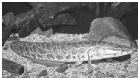
Snakehead ( Channa argus ) – a noxious fish not wanted in our waterways

Some people may wonder why certain exotic fish in their aquarium could possibly pose a threat to WA's rivers and oceans. But when domestic circumstances change or the original owners lose interest, the aquarium may become a burden and the temptation is to dump the fish in the nearest waterway. Once exotic fish become established in the wild it is difficult, or even impossible, to eradicate them. The Department of Agriculture and Food, Western Australia (DAFWA) recently received