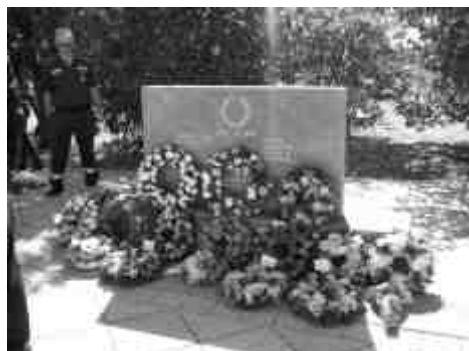
Many wreaths were laid on Anzac Day