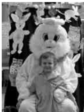
Blaze with a special visitor

We had some wonderful Year 6/7s helping out as well as plenty of eager parents. Everyone seemed to