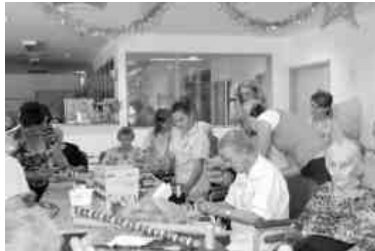
WDHS students enjoy Christmas with Pam Corker residents.

Students from Waroona District High School jumped into the Christmas Spirit, when they visited Pam Corker last week. Six students from year 6 were excited to sing Christmas carols with residents as well as create bon bons and Christmas cards. Both teachers and staff were very impressed by the student's behaviour and rapport with the elderly residents; they were quoted as being both respectful and attentive.