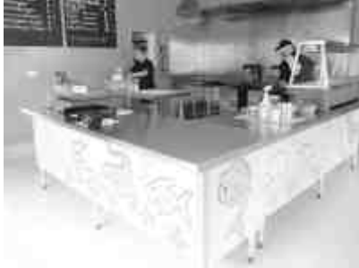
Kurt & Nat hard at work

We are looking at how to overcome some teething problems and doubled up on stock in order to avoid a shortage over the New Year weekend.