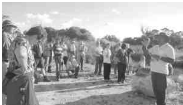
An attentive crowd at the River Ramble