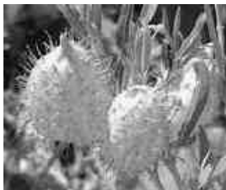
Cotton bush seed pods ready to release thousands of wind blown seeds.

There are many other plants, often escapees from the home garden which have become weeds in Western Australia. Although not necessarily declared weeds they can invade bushland and oust native species.