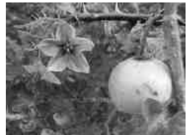
Apple of sodom, a poisonous weed related to potatoes and tomatoes.

Keep an eye open for these pests in your home garden and get rid of them before they take over.